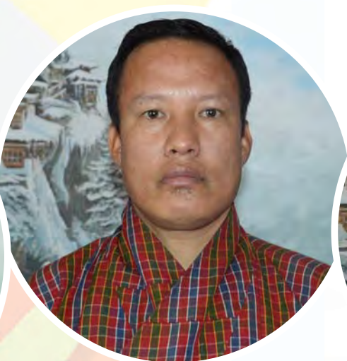
JANGCHUBLA Traditional Boot Manufacturing Chubacha, Thimphu